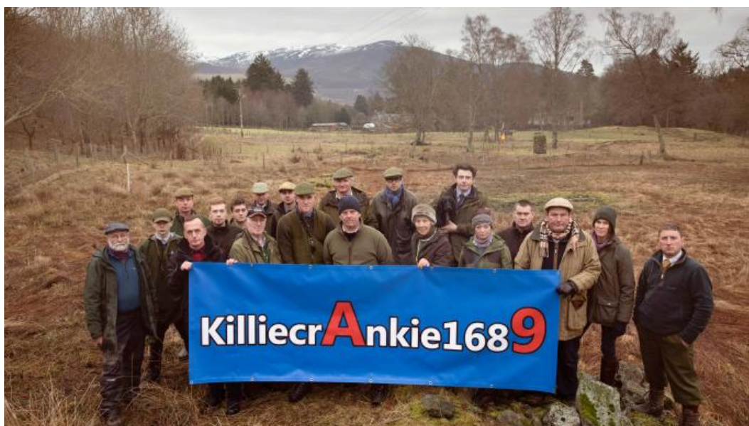
Campaigners say the battlefield should have been central to the plans to re-route the A9